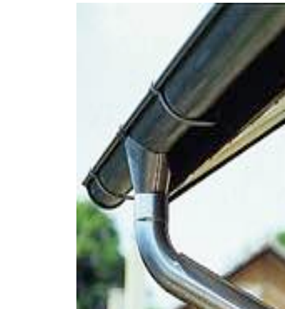
ZINC RAIN WATER PIPES