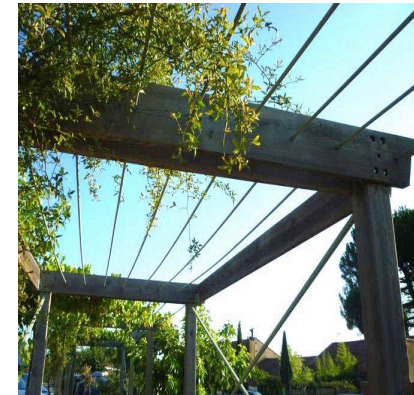
SEASONAL SOLAR SHADING