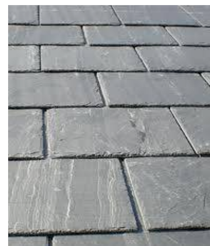
ROOF TILE TO MATCH EXISTING