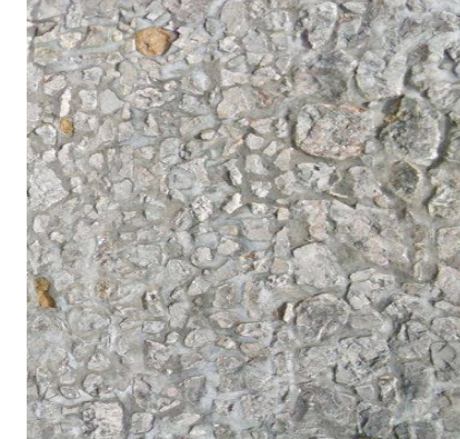
STONE CLADDING TO MATCH EXISTING HISTORIC GARDEN WALL TO REAR OF SITE